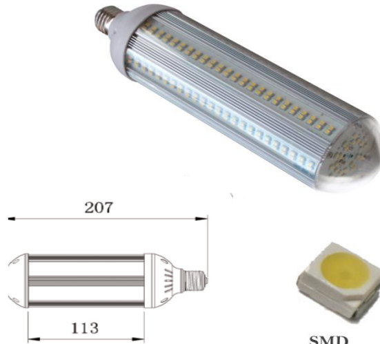
SMD Surface Mounted Diode

Our LED Post Top Lamps are made with the best quality Surface Mounted Diode (SMD). SMD provides better light quality and consistency; it has a slower depreciation in lumen output than other forms of Solid State Light.