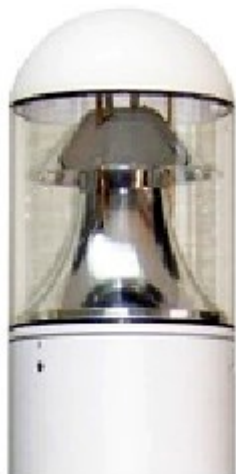
**Product shown in custom

The CLB-3079 is built with extruded aluminum housing, includes a flush mounting base and vandal-resistant screws. It has a domed top and a powder coat finish over chromate conversion coating. For easy maintenance, this fixture includes an internal ballast tray. The CLB-3079 is specially designed with an aluminum cone reflector for LED. This fixture has a clear polycarbonate lens and a mounting kit with 8" anchor bolts (included). It has an LED Array 14.5w and a system wattage of 17w. It is ideal for lighting pedestrian walkways and accenting exterior grounds of office and apartment buildings, hotels and parks. Lastly, investing in a CLB-3079 comes with a 10 year warranty.