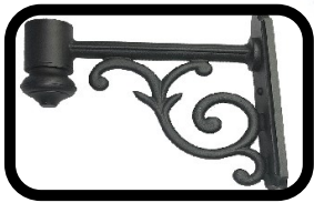
**optional wall mount shown

The SL-MS has an elegant design that adds style and class to any location. A few locations that this fixture is suitable for are: townships, parks, walkways, housing communities, and driveways. Internally, the SL-MS is durable, reliable and designed to tolerate wet locations. A 10 year/100,000 hour limited warranty is included along with your investment.